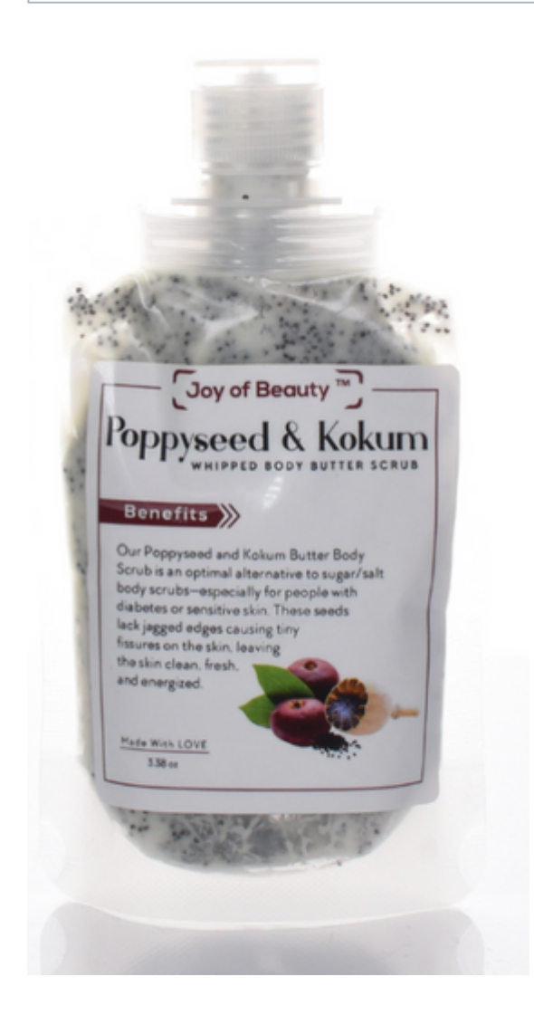
Joy of Beauty Poppyseed & Kokum Whipped Body Butter Scrub