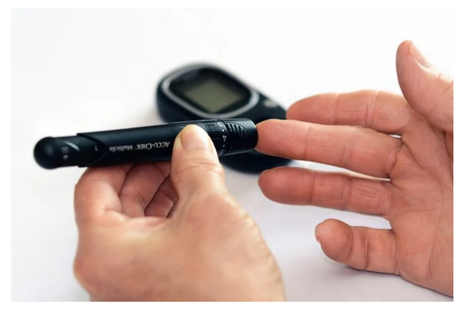
Diabetics must be careful of not only what they put in their body, but on their body.

The disease can be controlled effectively through medicine, but some complications from diabetes, such as chronic high blood sugar, can weaken the immune system. The risk of severe infection from minor injuries like cuts or scrapes is high, and it can even lead to the need for amputation. This is why it's helpful to have an outside person examining and taking care of their feet, especially for those who cannot do so for themselves due to age, pain, or lack of energy.